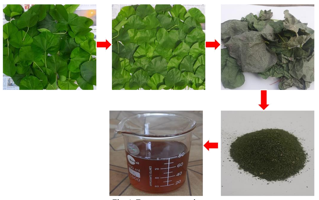
Fig. 1: Extract preparation

A bacterial strain of interest is grown in pure culture. Using a sterile swab, a suspension of the pure culture is spread evenly over the face of a sterile agar plate. The antimicrobial agent is applied to the center of the agar plate. A hole can be bored in the center of an agar for a liquid substance. The agar plate is incubated for 18-24 hours (or longer if necessary), at a temperature suitable for the test microorganism.