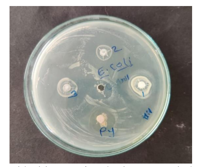
Fig. 3: Antibacterial activity was performed against gram negative bacteria (E coli)