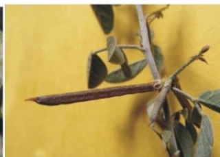
Fig. 3.4: Fruit of I. trita Linn.

Fig-1.1: Habitat of I. linifolia (L.F.) Retz., Fig-1.2: Twig of I. linifolia (L.F.) Retz