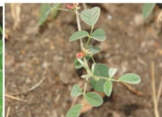
Fig. 3. 2: Twig of I. trita Linn.