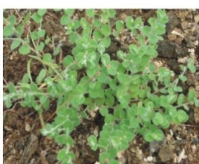
Fig. 2. 1: Habitat of I. cordifolia Heyne ex Roth.