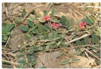
Fig. 1.1: Habitat of I. linifolia (L. F.) Retz.

species is 5-35 cm high. Branches many, copiously branched usually more or less clothed long white hairs. Root shows tap root system. The stem is ad pressed or spreading pubescent, biramous hairs with arms unequal. The leaves are simple, 6-15 X 4-12 mm long, sub sessile broadly ovate chordate, sub obtuse, mucronate hairy on both sides, very densely so beneath.