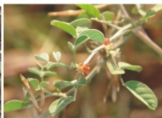
Fig. 3.1: Habitat of I. trita Linn.