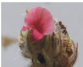
Fig. 2. 3: Flower of I. cordifolia Heyne ex Roth.