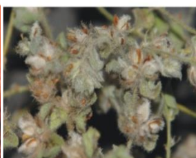
Fig. 2. 4: Fruit of I. cordifolia Heyne ex Roth.