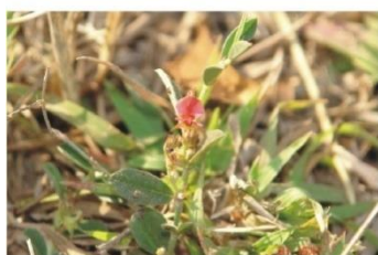
Fig. 1. 2: Twig of I. linifolia (L. F.) Retz.