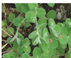
Fig. 2. 2: Twig of I. cordifolia Heyne ex Roth.