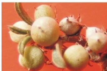
Fig. 1. 4: Fruit of I. linifolia (L. F.) Retz.