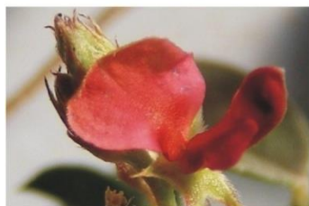
Fig. 1. 3: Flower of I. linifolia (L. F.) Retz.